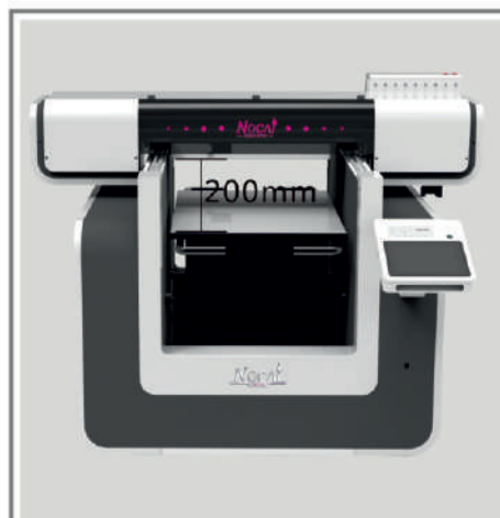
THE FIRST STAGE